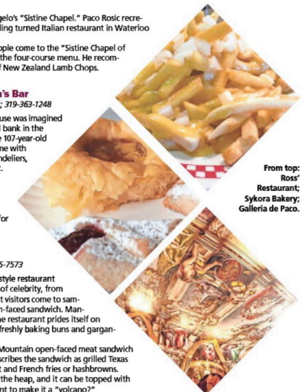
From top: Ross' Restaurant; Sykora Bakery; Galleria de Paco.