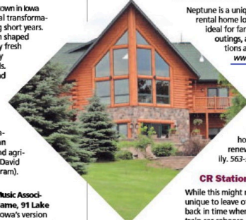
SPECIAL TO THE REGISTER Serenity Valley B&B, Ossian.

Neptune is a unique and luxurious waterfront vacation rental home located one hour from Des Moines. It's ideal for family vacations, reunions and corporate outings, and it offers year-round accommodations at Lake Panorama. 515-321-1789, www.interaproperties.com